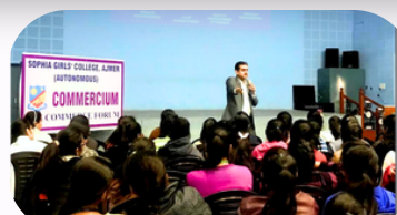
COMMERCIUM THE COMMERCE FORUM