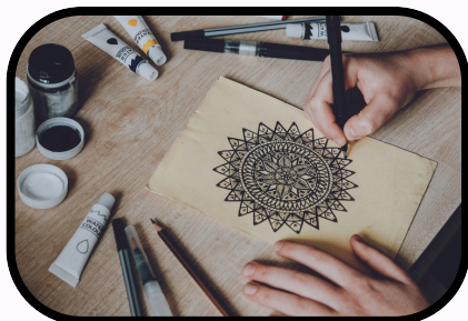
PICASSO THE ARTISTS' CLUB