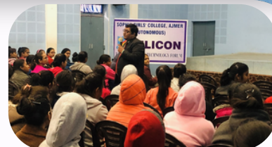
SILICON THE COMPUTER SCIENCE FORUM