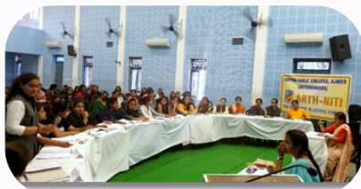
ARTH-NITI THE ECONOMICS FORUM