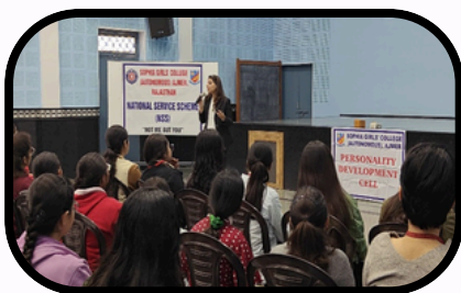
THE WOMEN'S DEVELOPMENT CELL