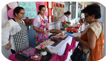
AASHIYA: THE HOME SCIENCE FORUM