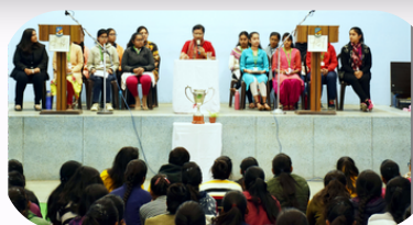
GYANODAYA THE HINDI FORUM