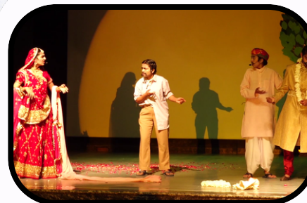
SPECTRUM THE DRAMATIC CLUB