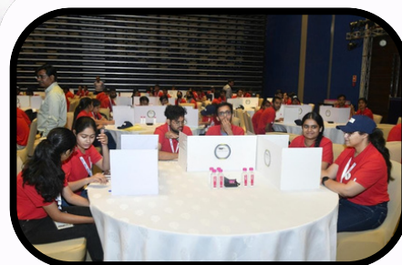
PAHELI THE QUIZZERS' CLUB