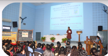
LYCEUM THE POLITICAL SCIENCE FORUM