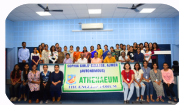
ATHENAEUM THE ENGLISH FORUM