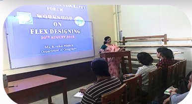
PRAKRITI THE GEOGRAPHY FORUM