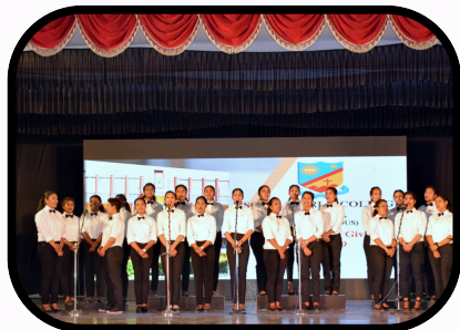
ANHAD THE MUSIC CLUB