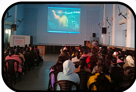
BIOSCOPE THE MOVIE CLUB