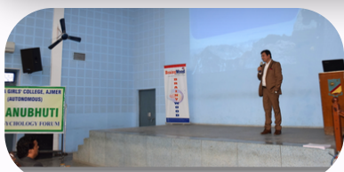
ANUBHUTI THE PSYCHOLOGY FORUM