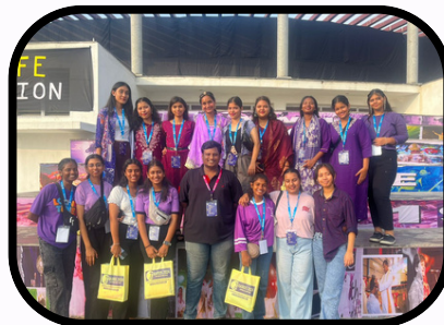
GOOD NEWS GROUP