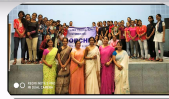
ORCHID THE BOTANY FORUM