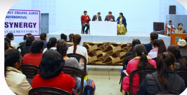
SYNERGY THE MANAGEMENT FORUM