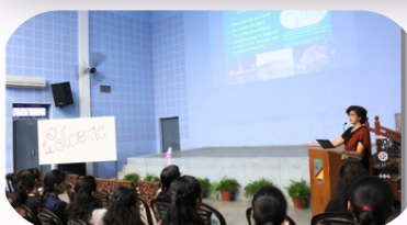
FLORICAN THE ZOOLOGY FORUM