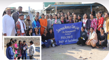
SOCIUS THE SOCIOLOGY FORUM