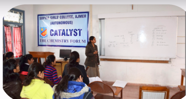
CATALYST THE CHEMISTRY FORUM