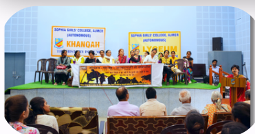
KHANQAH THE HISTORY FORUM