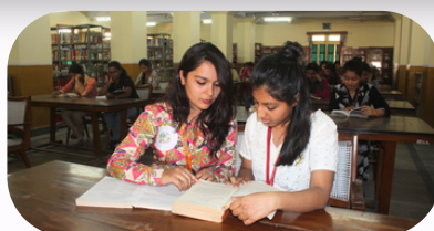
RANGANATHAN THE LIBRARY AND INFORMATION SCIENCE FORUM