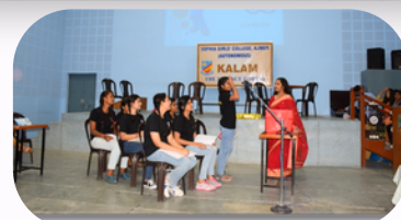
KALAM THE PHYSICS & MATHS FORUM