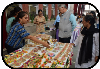
INNOVATIONS- THE ENTREPRENEURS' CLUB